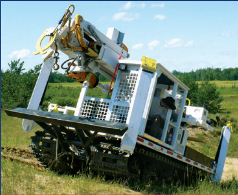
The only derrick on the market that can climb a 40 degree slope with a low center of gravity to provide excellent sideslope stability