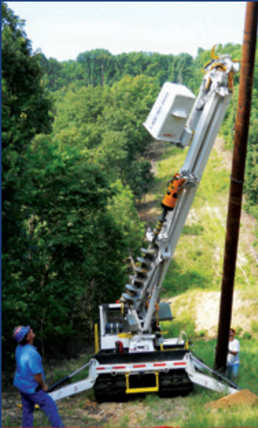
The Achiever can set up to 70' poles