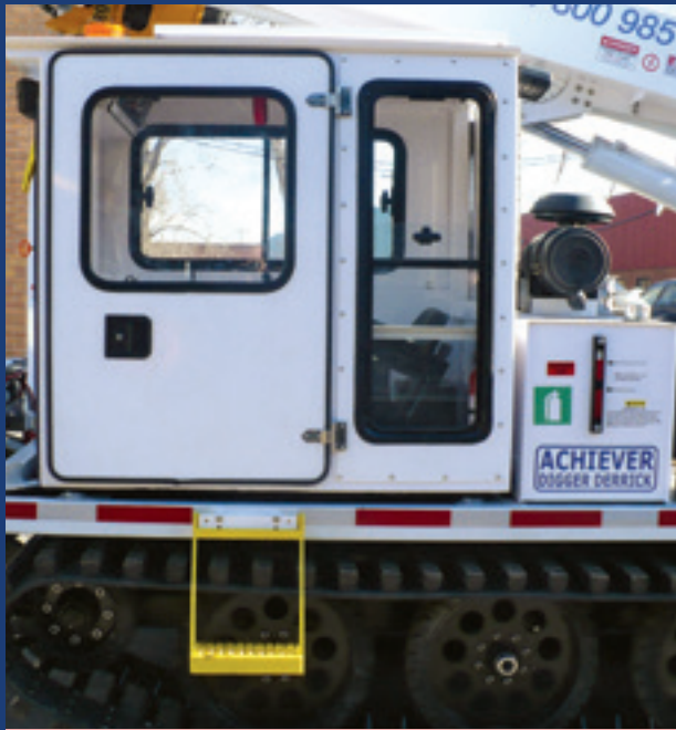
The optional closed cab comes with a front wiper, heater and two opening windows