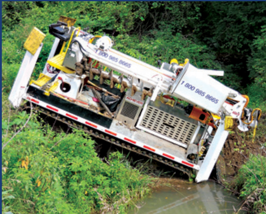
The Achiever's advanced track and suspension design and powerful engine allow it to go almost anywhere