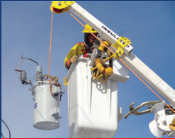
The optional material handling jib can lift up to 600 lbs