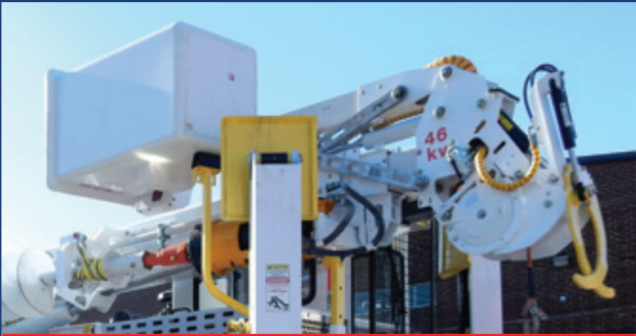
Optional 6,000 lb boom tip winch On fiberglass 3 rd boom, Insulated