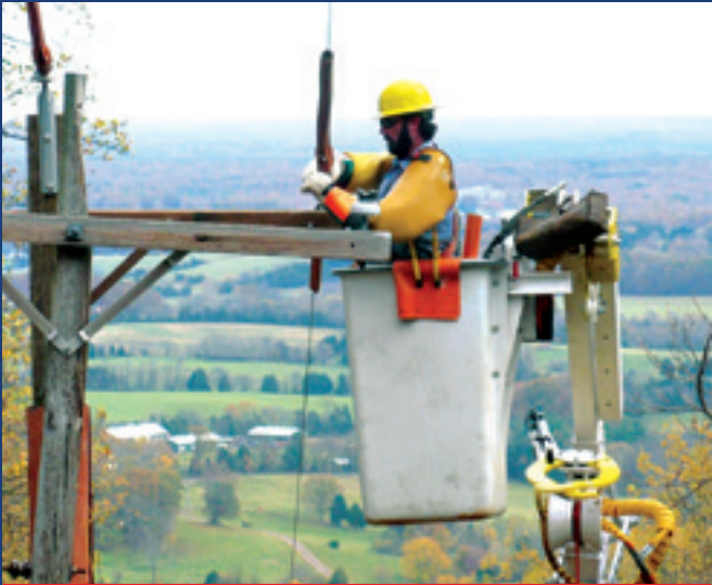
The insulated bucket has a 47' reach and comes with full pressure controls and an optional tool outlet and jib