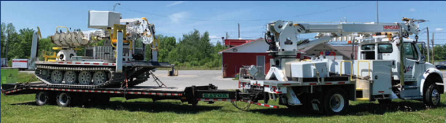
RT-02 DD Tracked Digger Derrick is easily transportable to jobsite on a dual axle trailer behind a single axle bucket truck