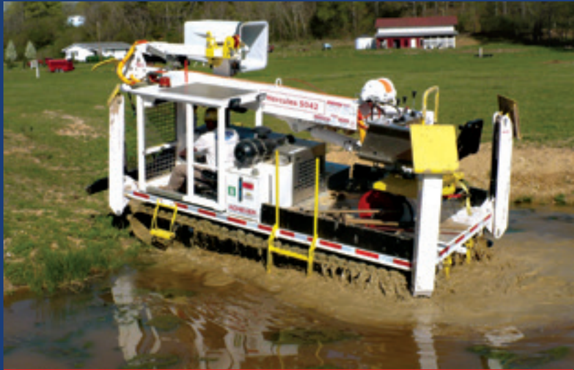
Low ground pressure means excellent flotation on soft ground